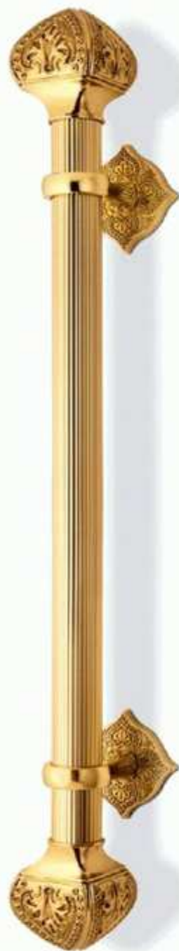
C49200 Vittoriano Victorian Style